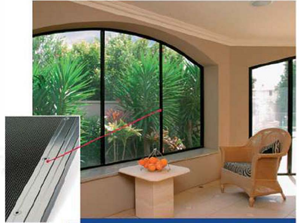
Stainless mesh screwed into frame

This result gives 4EverDoor Screens enormous strength against break-in attempts.