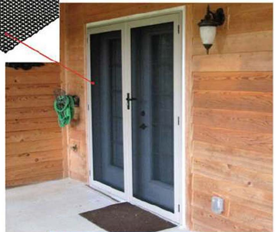
Thicker, stronger stainless steel mesh